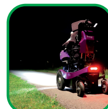
LED Light Pack