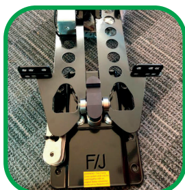
Balder Vehicle Dock