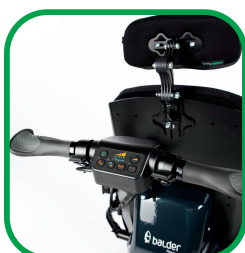
Movis Scoot Control